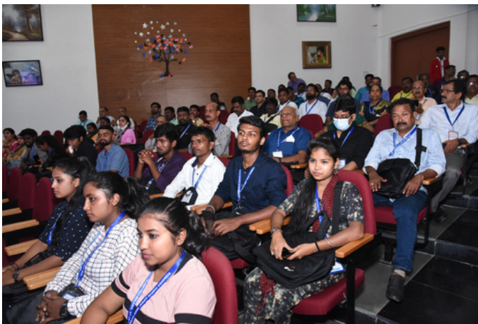
Delegates settle down for the cultural extravaganza at AIMIT Campus Beeri