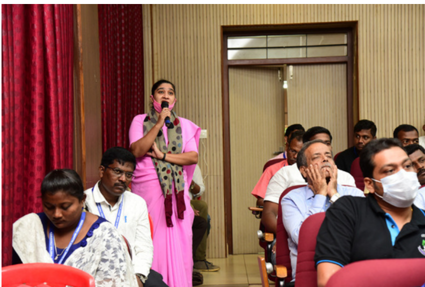
More clarifications and queries from the audience