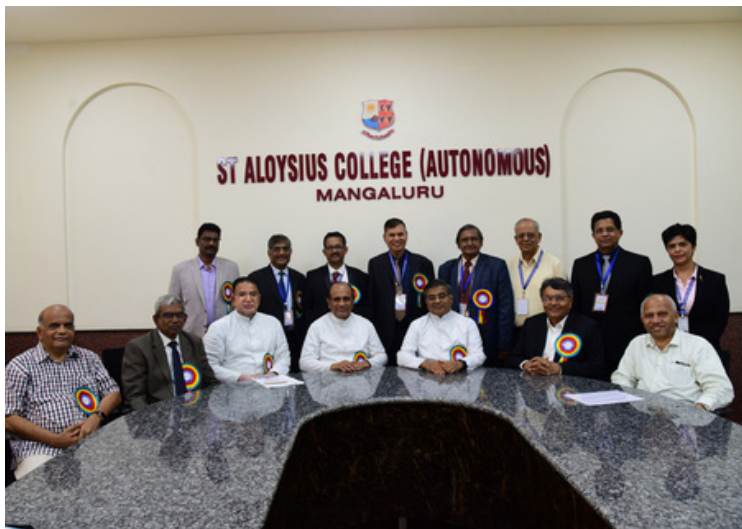
Organising Team with the Guests