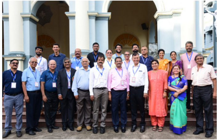
The Organising Team

As Organizing Secretary, my words of thanks and gratitude go to each and every one of the SACAA Executive Committee members, the SACAA Office Manager and staff, members of the College staff, volunteers, the maintenance department and to each everyone who helped in this effort. My special thanks to our generous sponsors and donors.