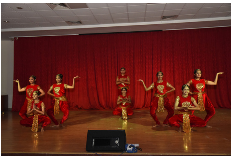
The Magic of music and dance captured the minds and hearts of the audience