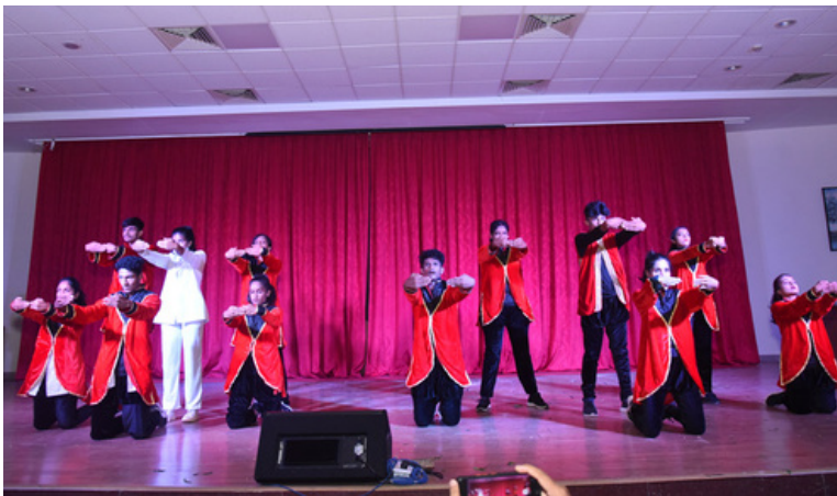
A Tribute to the Covid Frontline Warriors

with each other. As I write down my experience on how beautiful the cultural programs are, I feel melancholic on how these small moments have made me cherish and retain them as a book of memories, I will always look back to.