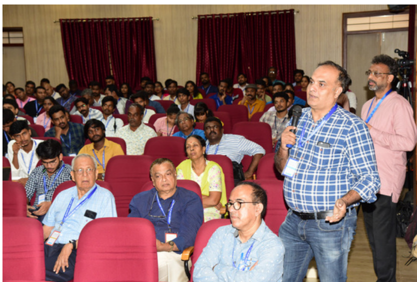
Deeper queries from the audiences