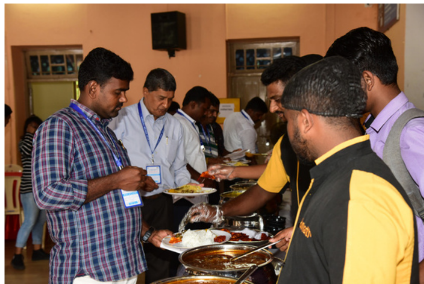
A coastal meal a perfect fuel to light up the congress