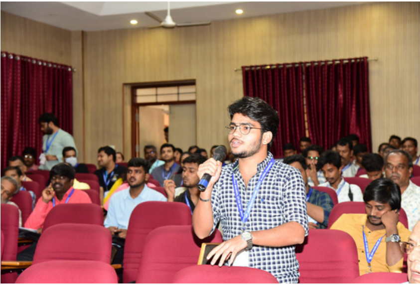
A progressive discussion with the resource person