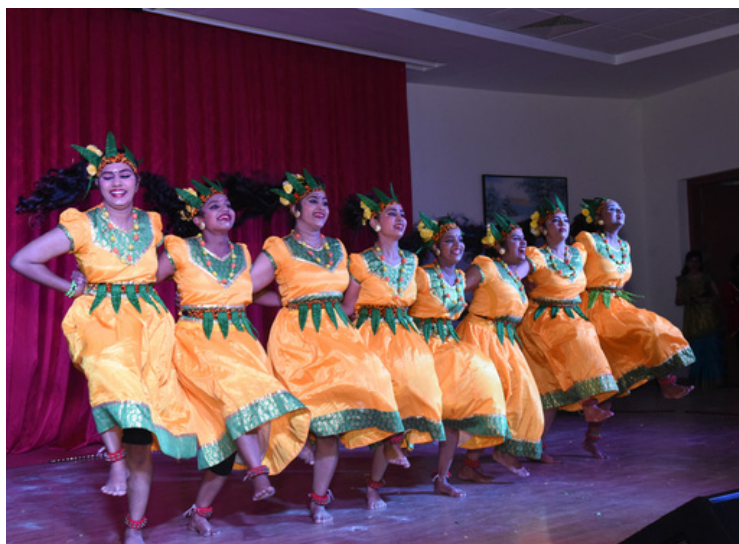
Tribal dance - Kaadar Nritham

The only way to worry about nothing, is to pray about everything. As we know, any programme is incomplete without seeking God's blessings, we began with a beautiful prayer dance, followed by the tribal dance group, from God's Own country, Kerala by our PG students. Tribal dance form of Kerala that is Kaadar Nritham, which is the primitive dance form of the kaadar tribe in Kochin forests, where only women partake and reflect the tradition and rituals of the land.