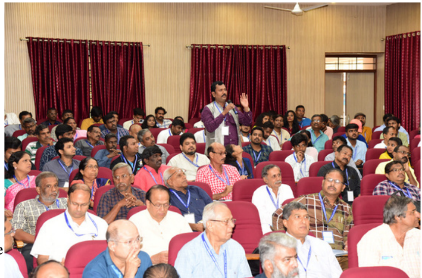
Interaction with the Resource Person