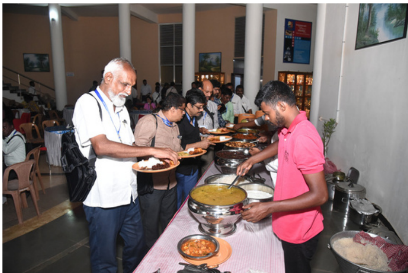
Participants at the Dinner Counter at AIMIT Campus, Beeri

Karavali Milana's success was due to the hard work of SACAA members and college staff. At the end of day two, we were delighted and content with the thumping success of organising this mega-event. We are certain that SACAA has set a new standard in organising this Congress. It has strengthened our ties with South Indian Jesuit Alumni Units. Let this Congress to serve as a springboard for alumni to reaffirm their commitment to their alma mater. Long Live the Alumni Movement!