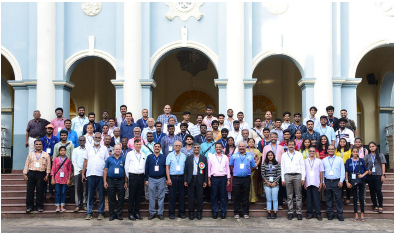
Delegates from five provinces - No better place to be- Posing before the St Aloysius Chapel!