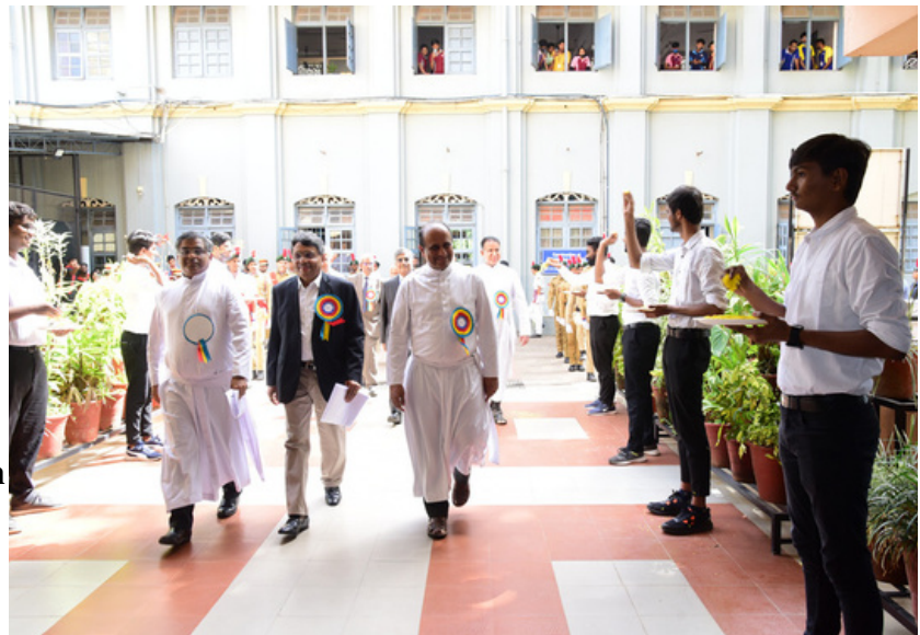
Showers of rose petals from the students of St Aloysius College (Autonomous)