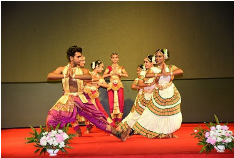
Beauty of South Indian Classical Dance A Wonderful performance by St Aloysius College Students