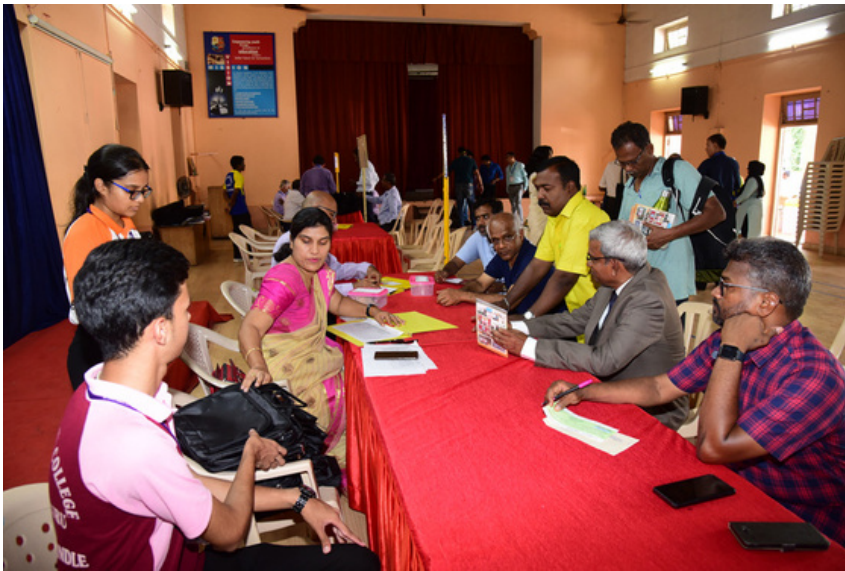
Registration in Process !