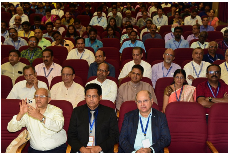
Delightful Delegates from five provinces